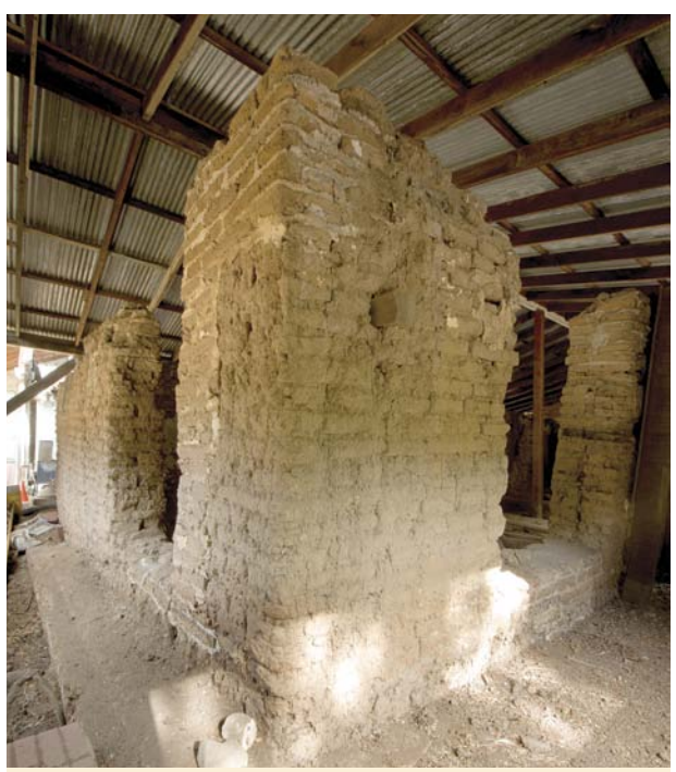
Remains of Camilo Ynitia's adobe

Serpentine rock outcrops house both fox and coyote dens. Oak trees attract western screech owls, nesting western bluebirds, white-breasted nuthatches and acorn woodpeckers. Grasses may hide horned