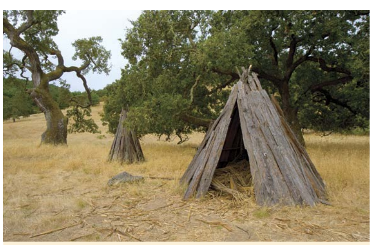
Reconstructed Miwok kotchas or dwellings

Burdell Barns and Outbuildings—The original barn has the white cupola; the other section was added around 1882. Other buildings include a blacksmith shop, cottage, large dairy barn and superintendent's house. Kitchen Rock —This large boulder east of the barns contains mortars of varying size.